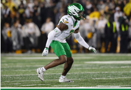
The top passing defense in the nation, Oregon has allowed more than 200 passing yards just once in nine games and has held four opponents to less than 100 yards through the air.