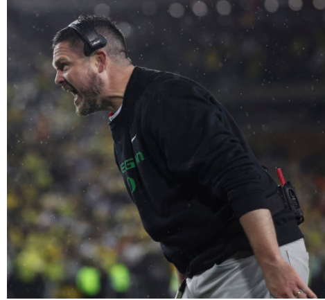
Oregon improved to 12-7 against ranked teams under HC Dan Lanning with its 18-16 win at No. 20 Iowa last week.

UO has rushed and passed for at least 175 yards six times and has held opponents under both marks six times. 175