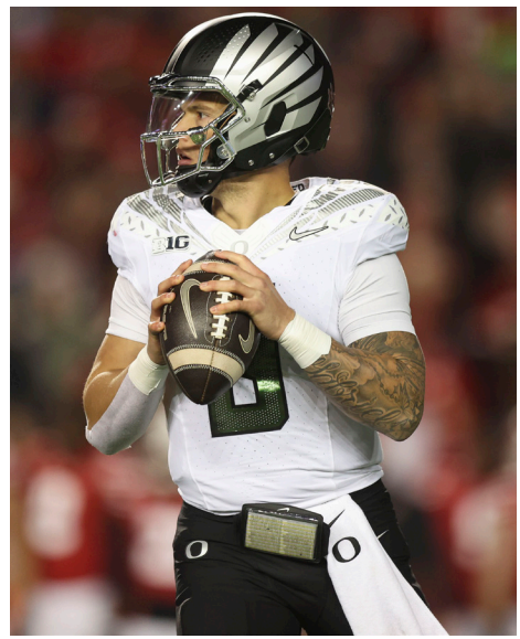
DILLON GABRIEL is one of 16 finalists for the 2024 William V. Campbell Trophy, the nation's premier scholar-athlete award. BO NIX won the award for the Ducks in 2023, and JUSTIN HERBERT won in 2019.