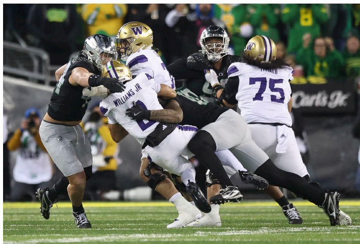
Oregon tied the school single-game record with 10 sacks in a dominant win over Washington, finishing off a 12-0 regular season for the second time in program history.