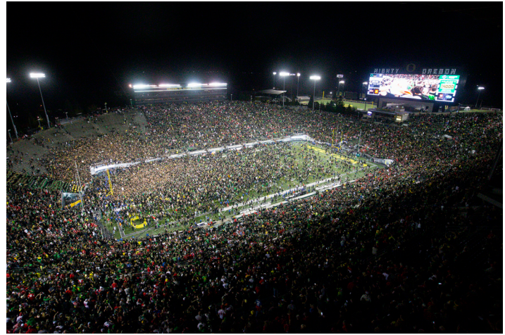
An Autzen Stadium record 60,129 fans stormed the field after Oregon defeated No. 2 Ohio State, securing the program's highest-ranked victory ever on its home field.