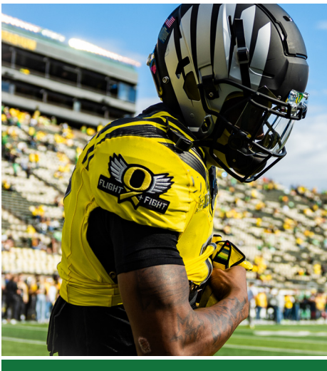
Oregon's Stomp Out Cancer "Heroes" uniforms were designed by the Lanning family.

All-time crowds in excess of 50,000 at Autzen: 142 (Out of possible 148 since 2002)