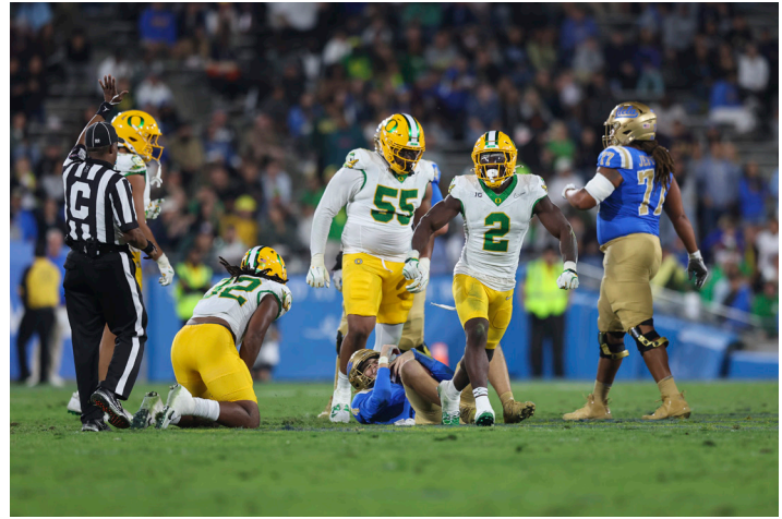
The Oregon defense allowed just 172 total yards and 47 rushing yards while holding the UCLA offense without a touchdown in the program's first Big Ten Conference win.