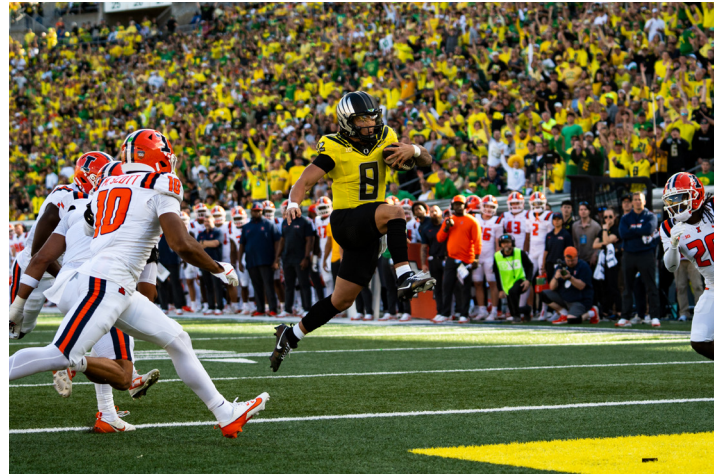
DILLON GABRIEL accounted for a season-high four total touchdowns and Oregon's defense was terrific once again as the No. 1 Ducks improved to 8-0 on the season.