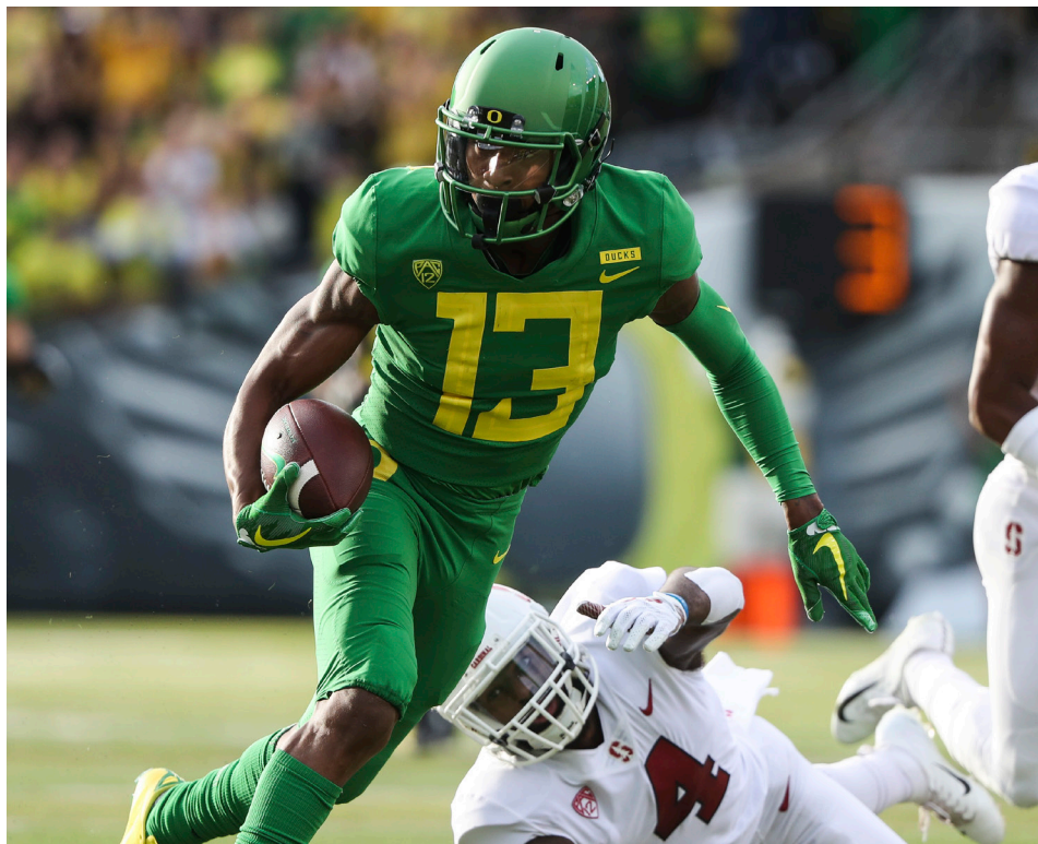
DILLON MITCHELL'S 14 receptions against Stanford in the 2018 Pac-12 home opener are the most-ever by a Duck inside Autzen Stadium. He hauled in 14 of 17 targets for 239 yards, which are the second-most by a Duck in Autzen.