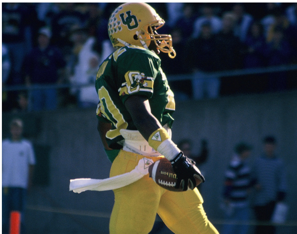
KENNY WHEATON'S historic 97-yard pick-6 against Washington in 1994 is the longest interception return for a TD in Autzen Stadium history. Wheaton is one of three Ducks with multiple pick-6s in Autzen Stadium.