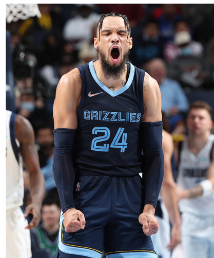
Brooks missed the start of the season due to injury, but now has 10 20-point games.

The #ProDucks continue to represent the Ducks in NBA games with Oregon PE's.