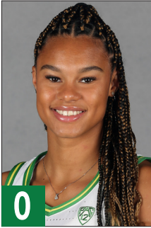
0 SATOU SABALLY Jr. | Forward | 6-4 Berlin, Germany