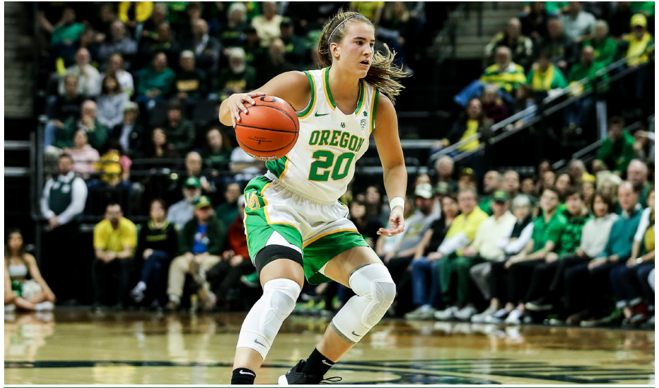
No. 10 in NCAA WBB history with 907 career assists entering this weekend, SABRINA IONESCU leads the nation with 8.8 assists so far this season, 3.2 more than any other player in the Pac-12.