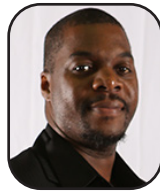
Alpha English Assistant Coach Ninth Season