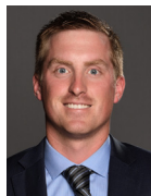
Sam King Wide Receivers Field