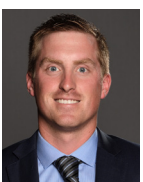
Sam King Wide Receivers Field