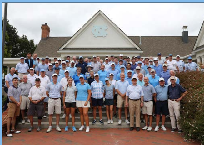
Executive Cup 2021