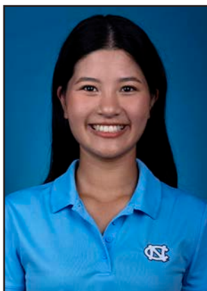
Freshman St. Peter's Cambridge School Cambridge, New Zealand