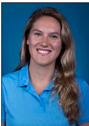
5th-Senior Burlington, N.C. Williams HS