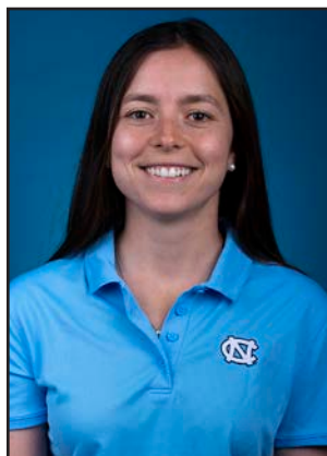
Senior San Sebastian, Guipuzcoa, Spain St. Patrick's English

Career: Played in 16 tournaments over three seasons • Highest finish is a tie for 19th at the 2022 ACC Championship • Career-low round is 68 as a sophomore in the Cougar Classic • Also shot 69 in the 2023 NCAA Pullman Regional • Twice made the ACC Academic Honor Roll and a two-time WGCA All-American Scholar.