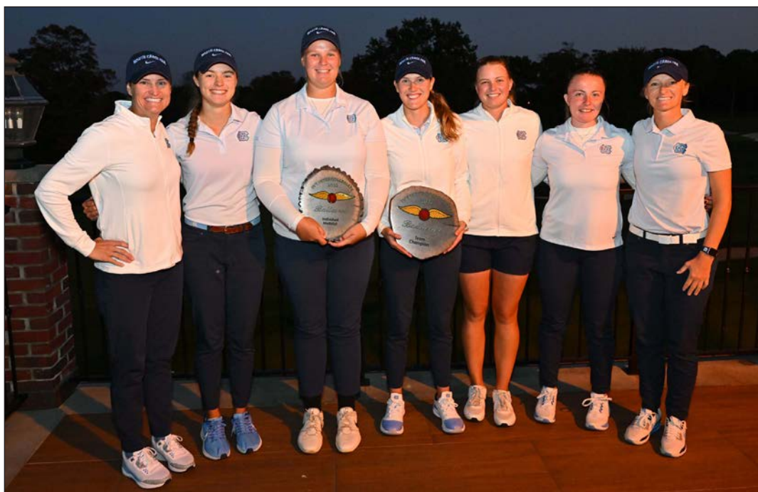
Carolina won the 2022 Ivy Intercollegiate at Baltusrol Golf Club in Springfield, N.J.