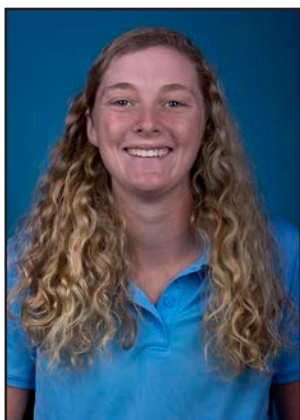
Freshman Atlanta, Ga. Rivers Academy Alpharetta, Ga.

Prep/Amateur: Won the 2023 Georgia Women's Amateur at the Horseshoe Bend Country Club in Roswell, Ga. • Shot 5-under-par 67 in the final round Sunday for a 6-under 207 total and a three-stroke victory • Began the final round three back, but birdied 12, made an eagle on 14 and birdies on 15, 16 and 17 to shoot 30 on the back nine for the win • The 67 tied her low round • Also shot 67 in the 2021 Georgia High School State Championship at Heritage Golf Links in Tucker, Ga. • In 2023 she tied for 16th at the Kathy Whitworth Invitational and T30 at the Rolex Girls Junior • Played in the 2023 U.S. Women's Amateur in Los Angeles • In 2022 she finished second in the Georgia Junior PGA, seventh at Georgia