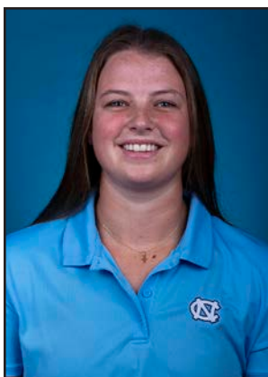
Sophomore Cape Town, South Africa Somerset College High School