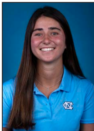
Senior Madrid, Spain Coronado HS Coronado, Calif.

Career: Played in 21 tournaments over three seasons for the Tar Heels • Has the 17th-lowest stroke average in UNC history (75.65) • Cut more than four strokes per round from her freshman to junior seasons • Averaged 75.65 in 62 collegiate rounds • Completed 10 rounds at or below par, including four in the 60s • Low round of 66 in the final round of the 2023 ACC Championship (equaled the second-lowest round ever by a Tar Heel and tied the best round ever in an ACC Championship by a Tar Heel) • Career-best T10 at the 2023 Liz Murphey Collegiate Classic in Athens, Ga. • Scoring best is 2-under 214 at the 2023 MountainView Collegiate in Tucson • Is 6-4-1 in