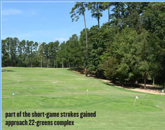
part of the short-game strokes gained approach 22-greens complex