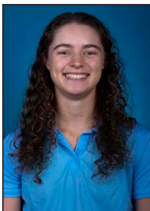
Junior Bryn Mawr, Pa. Haverford HS Havertown, Pa.

2022-23: Played in seven of UNC's 12 tournaments, including five times in the starting lineup in stroke play and once in the NC State Match Play • Averaged 76.00 over 15 rounds • Career-low 70 in the final round of the NCAA Pullman Regional • Tied for 20th at 5-over 221 at the Tar Heel Invitational • Shot rounds of par 72 in the Cougar Classic and the Tar Heel.