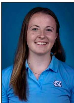
Sophomore Stavanger, Norway Wang Toppidrett Stavanger School

2022-23: Played in nine tournaments • Averaged 77.04 per round • Season-low 70 in the third round at the Landfall Tradition in Wilmington • Shot even-par 72 in the final round at the MountainView Collegiate in Tucson • Tied for 17th and was a team counter in both rounds in the Ivy Intercollegiate, which UNC won.