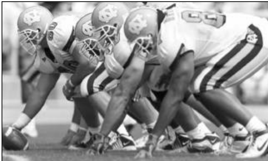
Carolina's young offensive line features one freshman, three sophomores and just one senior starter.

This year's bowl participants played an average of five bowl bound teams.