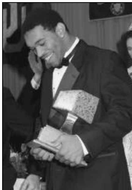
Julius Peppers became the first Tar Heel to win a major college football award when he won the 2001 Lombardi Award in Houston on Dec. 5.

Peppers was named the 2001 Chevrolet National Defensive Player of the Year. He is the first Tar Heel to earn the honor. As part of the award, Chevrolet will make a $2,500 contribution to the UNC general scholarship fund in Peppers' name. Peppers finished the season with 63 tackles, including 19 tackles for loss and 9.5 sacks. Since bowl statistics do not count toward official statistics, Peppers finished his UNC career with 30.5 sacks in three years. He is second to Greg Ellis (32.5) in career sacks at UNC.