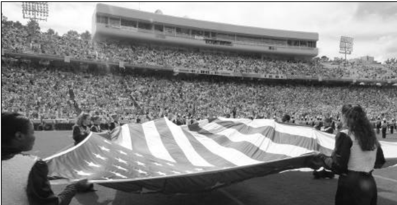
Carolina completed its best season at Kenan Stadium in five years with a 5-1 record.