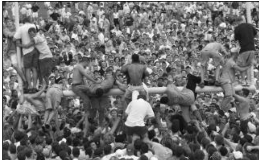
Carolina fans celebrated wildly after defeating Florida State 41-9 on Sept. 22, 2001.