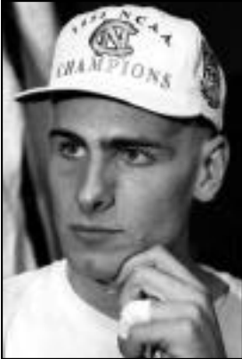
Eric Montross talks with the media after winning the 1993 national championship.