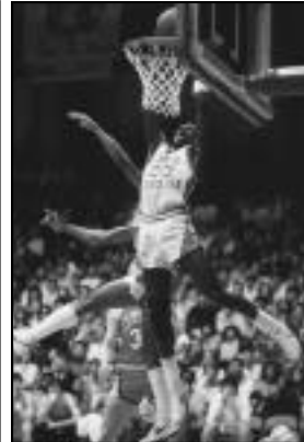
Michael Jordan led Carolina to an 88-13 record and a 1982 NCAA championship in his three seasons in Chapel Hill.