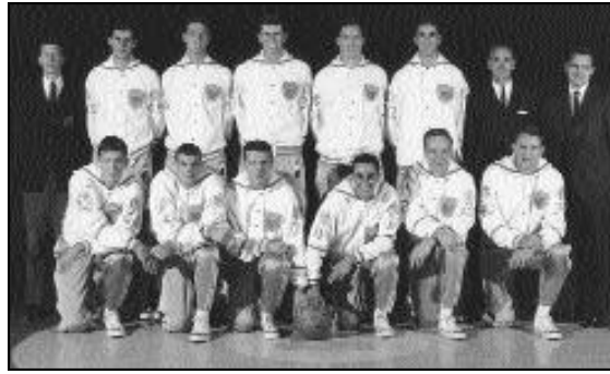
The 1961-62 team was Dean Smith's first as Carolina's head coach. Philadelphia 76ers head coach Larry Brown (kneeling, third from right) was a member of that squad.