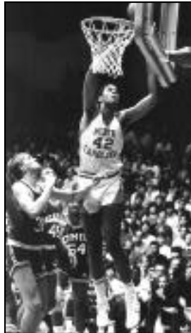
Brad Daugherty was an All-America and the first overall selection in the 1986 NBADraft.