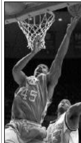
Julius Peppers's tough play in the 2000 NCAA Tournament helped Carolina to its 15th Final Four appearance.