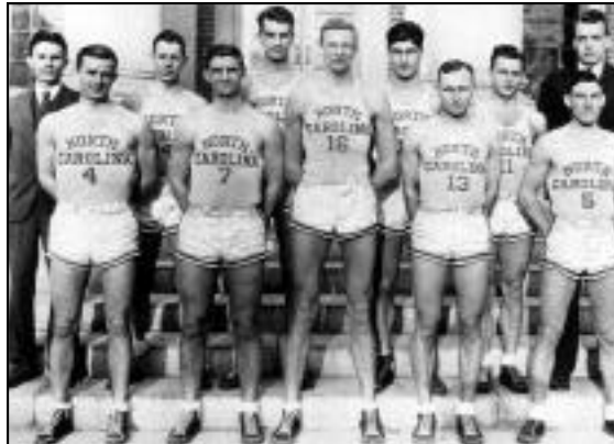
The 1934 Carolina team went 18-4 and tied for second place in the Southern Conference standings.