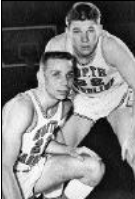
Bob Lewis (left) and Larry Miller led the Tar Heels to the 1967 Final Four, Dean Smith's first as a head coach.