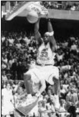
Antawn Jamison was the unanimous National Player of the Year in 1997-98.