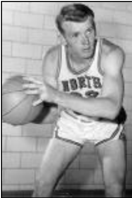
An All-America in the classroom and on the court, Billy Cunningham is a member of the Naismith Basketball Hall of Fame and was named one of the NBA's 50 greatest players ever.