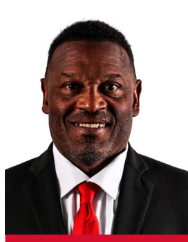
KEVIN SUMLIN Associate HC/Co-Offensive Coord./TE First Year at Maryland