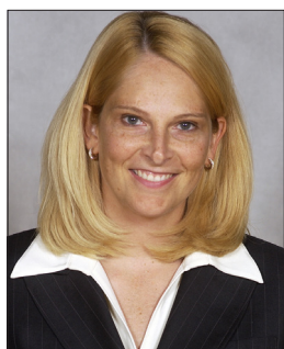
BRENDA FRESE Head Coach Arizona '93 17th year at Maryland 20th year overall