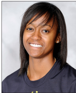
32 Shatori Walker-Kimbrough G • 5-11 • Fr.-HS Aliquippa, Pa. Hopewell HS