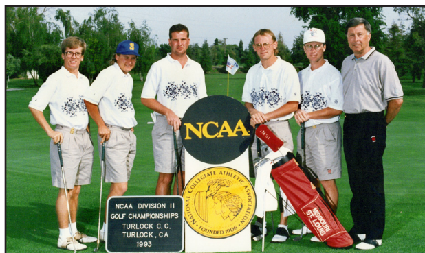
The 1992-93 team repeated as MIAA champions.