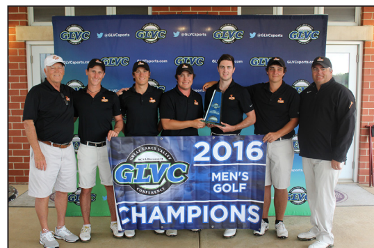
The 2015-16 team repeated as GLVC champions