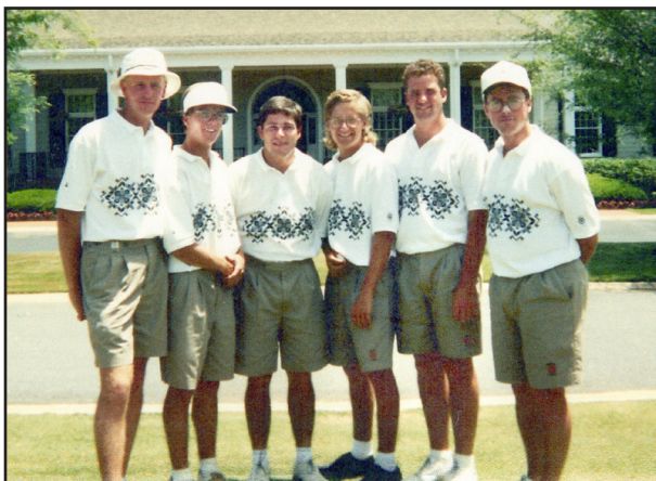
The 1991-92 team won the program's first-ever conference championship.

^ - Freshman of the Year; # - Player of the Year