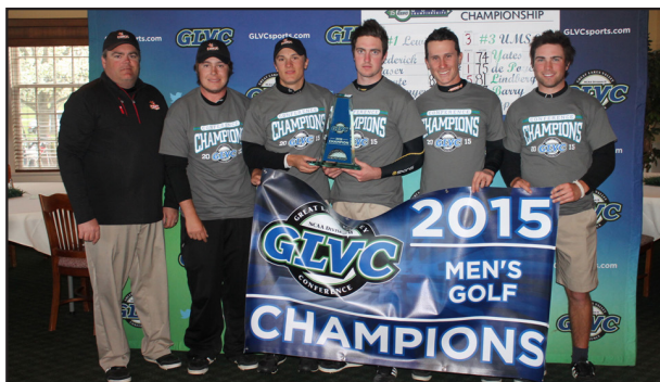
The 2014-15 team won the program's first GLVC Championship