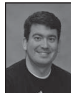
TOM FENSTERMAKER ATHLETIC COMMUNICATIONS