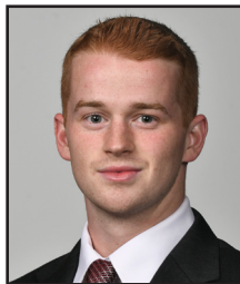
TY FARMER #3 • FR • D