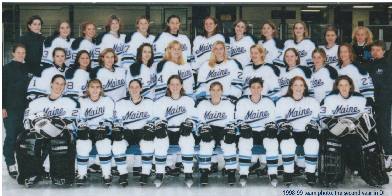
1998-99 team photo, the second year in DI

Maine women's ice hockey is celebrating its 21st season as a program. Rising from club to Division I in the fall of 1998, the Black Bears have always competed at the highest levels of women's hockey. The program was first affiliated with ECAC Hockey until 2001-02, when they switched to the newly formed Women's Hockey East where they remain today.