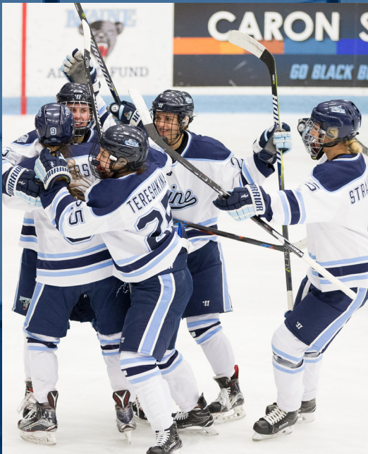
Program first playoff win in a quarterfinal against Boston University, first playoff series win in a third game overtime thriller in that same series, advanced to Hockey East semifinals.