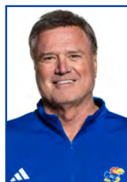
BILL SELF Head Coach 23rd Year at Kansas