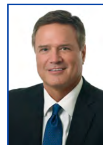
HC BILL SELF Head Coach 20th Year at Kansas