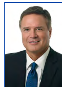
HC BILL SELF Head Coach 20th Year at Kansas