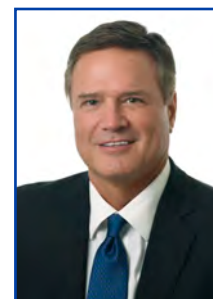
HC BILL SELF Head Coach 20th Year at Kansas