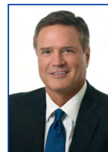
HC BILL SELF Head Coach 20th Year at Kansas