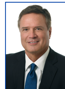
BILL SELF Head Coach 21st Year at Kansas