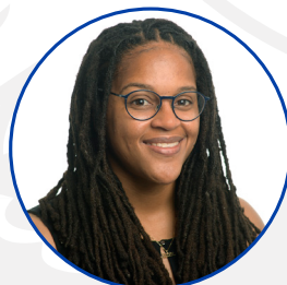
AC JHASMIN PLAYER 2ND SEASON