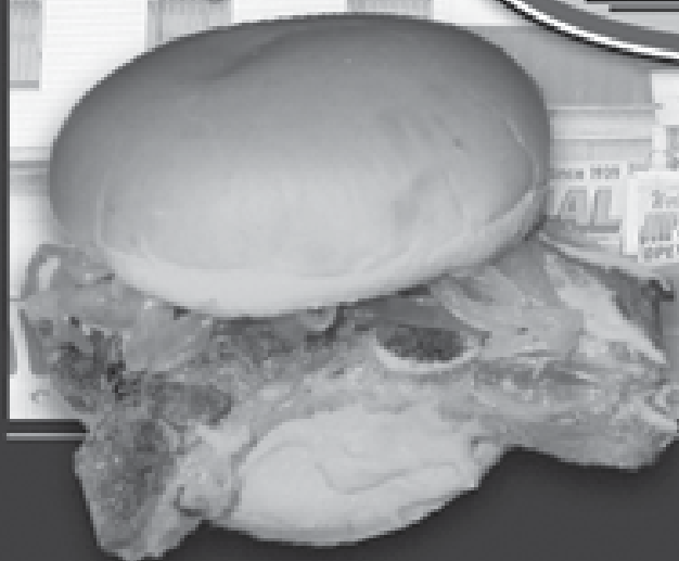
THE ORIGINAL MAXWELL STREET PORK CHOP SANDWICH