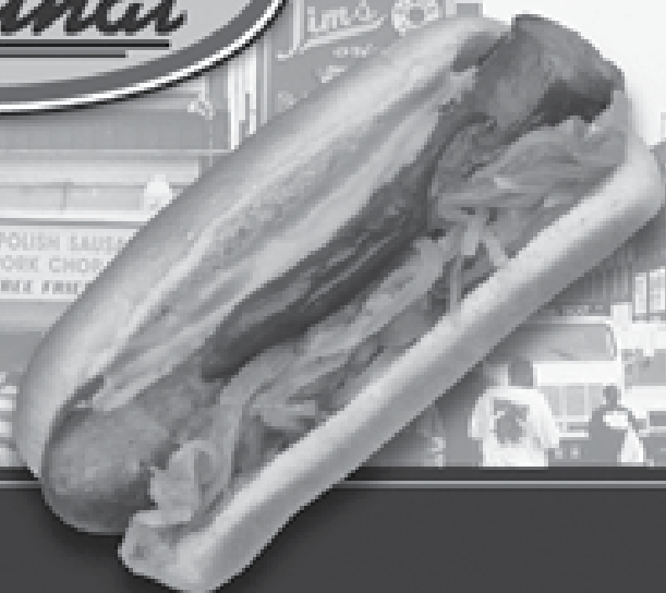
THE ORIGINAL MAXWELL STREET POLISH SAUSAGE SANDWICH