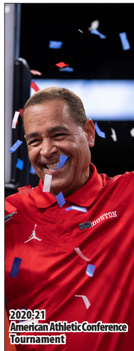
2020-21 American Athletic Conference Tournament