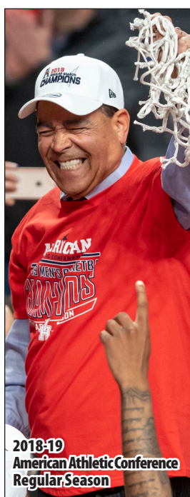
2018-19 American Athletic Conference Regular Season