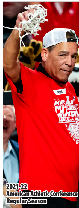
2021-22 American Athletic Conference Regular Season