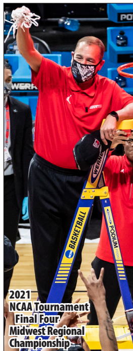
2021 NCAA Tournament Final Four Midwest Regional Championship