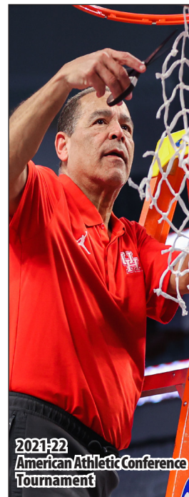
2021-22 American Athletic Conference Tournament