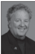
TOM PENDERS Head Coach