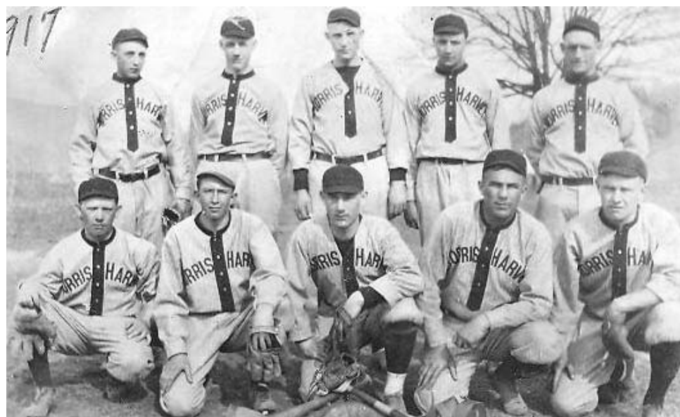
MORRIS HARVEY COLLEGE BASEBALL TEAM (1917)