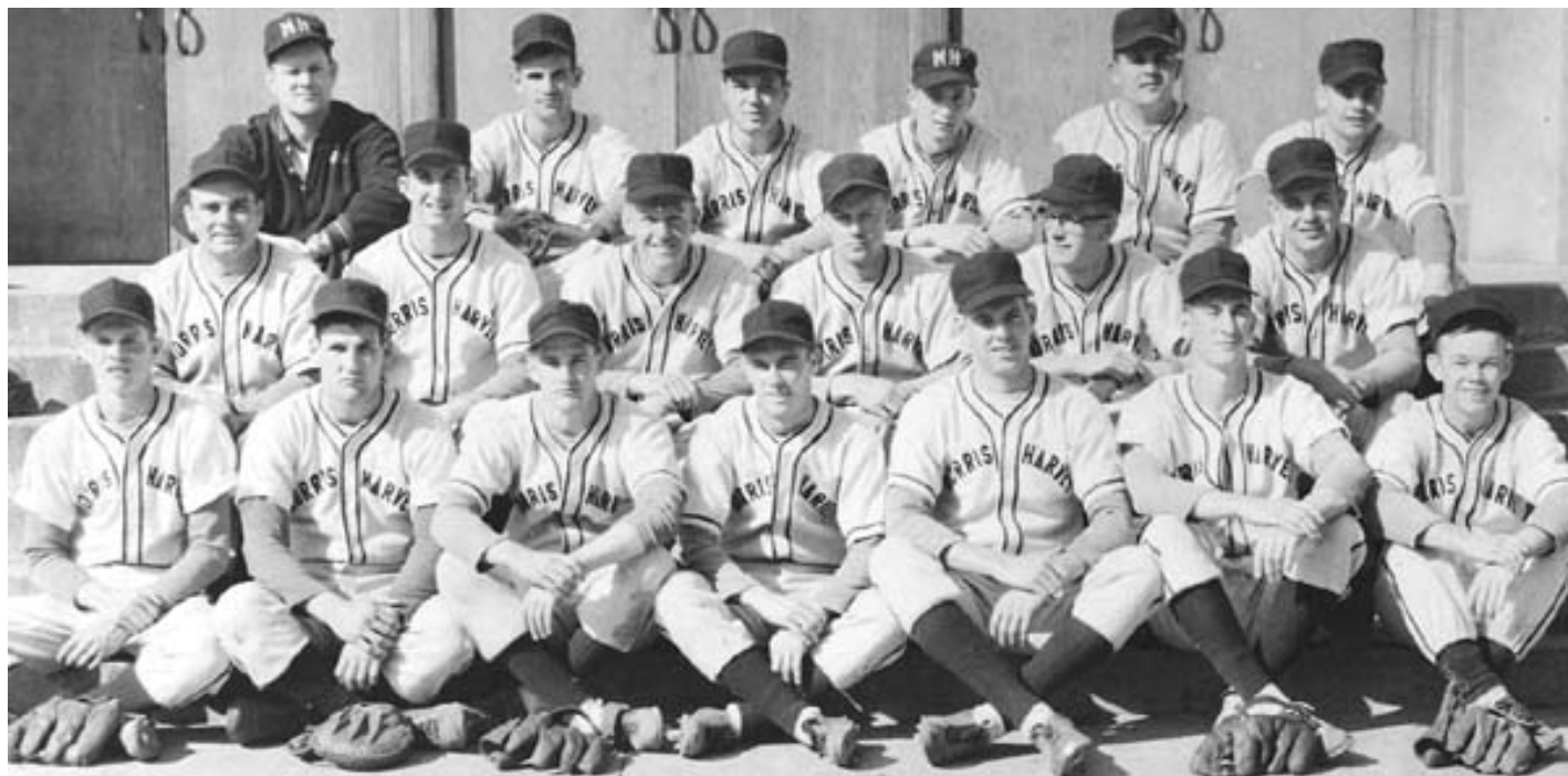
MORRIS HARVEY COLLEGE BASEBALL (1951)