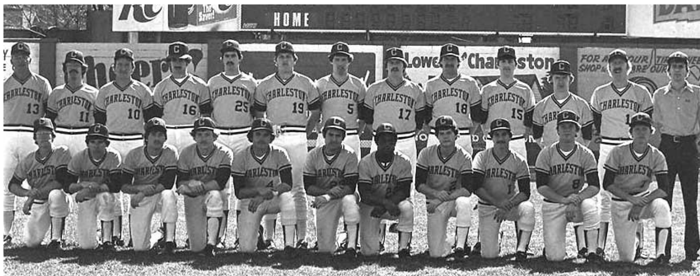
UNIVERSITY OF CHARLESTON BASEBALL (1981)