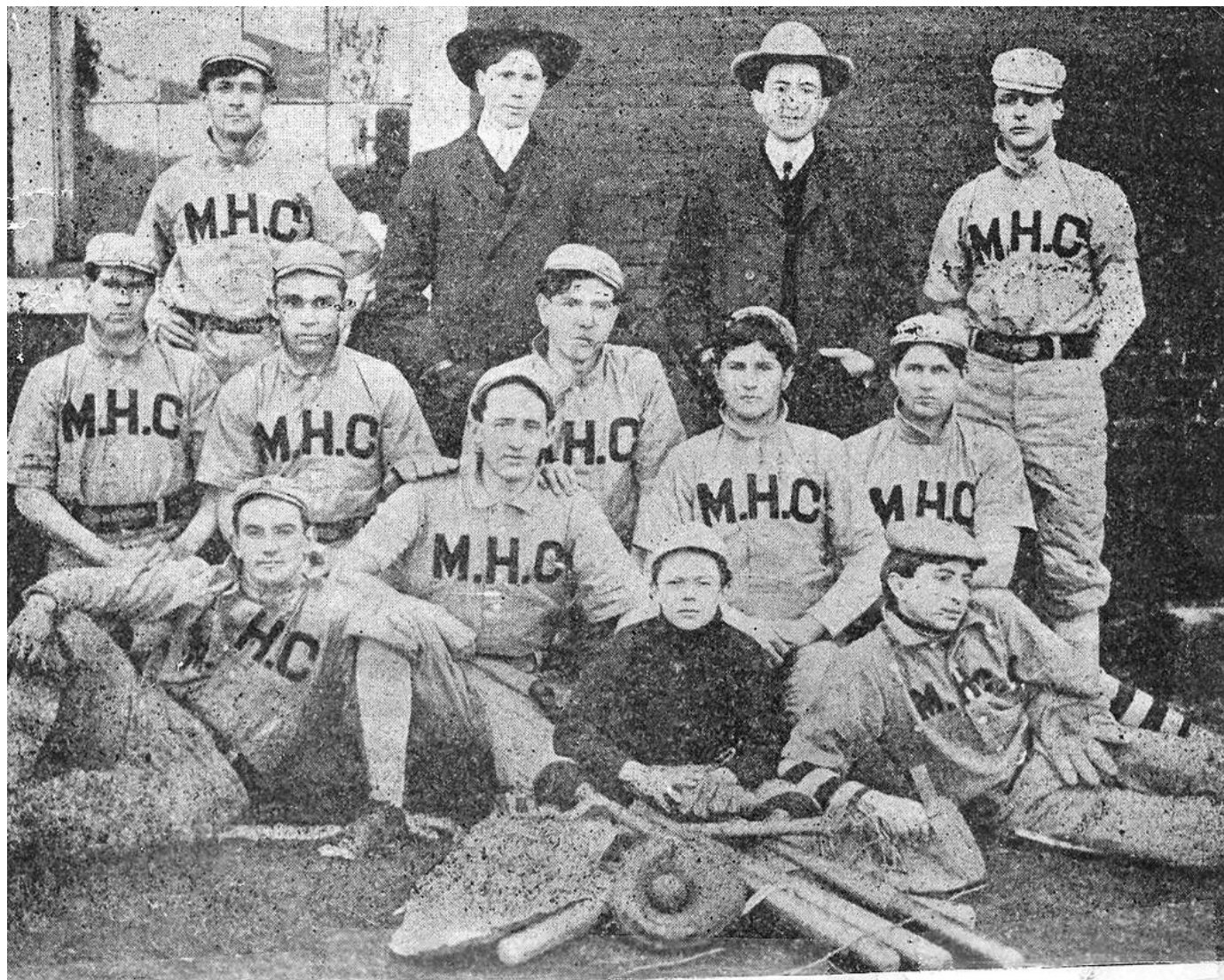
INAUGURAL MORRIS HARVEY COLLEGE BASEBALL TEAM (1904)