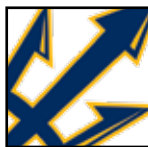
No. 1 UC San Diego 29-21, 26-14