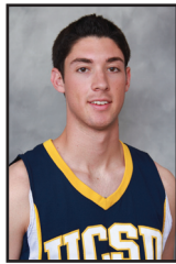
22 • BLANCHARD