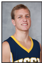
10 • McCANN