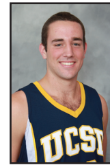
30 • PORTER