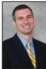
AC • OLEN