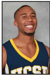
20 • BRUE