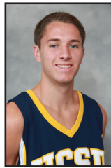
23 • TARABILDA