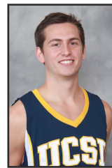
14 • BOHANAN