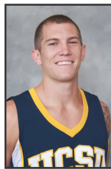
13 • BAILEY