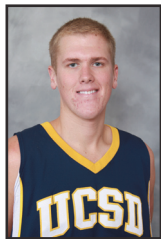
42 • HATCH