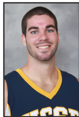
44 • WHEELER