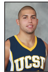
15 • MEZA