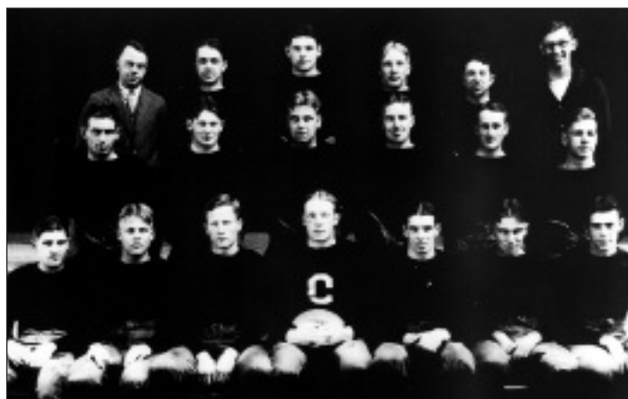
The 1924 Football Team

U C O N N F O O T B A L L 2 0 0 7 P R E V I E W C O A C H I N G S T A F F 2 0 0 6 R E V I E W O P P O N E N T S H I S T O R Y R E C O R D S U N I V E R S I T Y