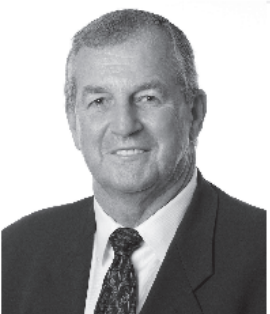
JIM CALHOUN HEAD COACH 24TH YEAR AT UCONN