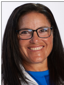
Lisa Fernandez Associate Head Coach 28th Season · UCLA '95