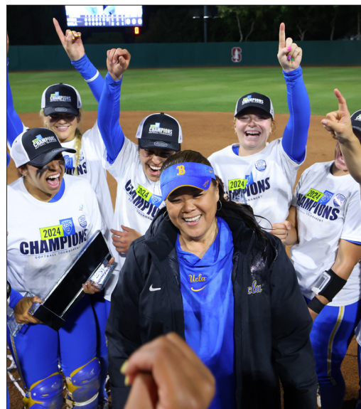
UCLA after winning the 2024 Pac-12 Tournament title.