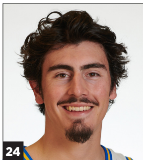
24 JAIME JAQUEZ JR. JR, Guard/Forward – 6-7, 225 PPG: 13.3 RPG: 5.5 APG: 2.2 GP/GS: 28/28