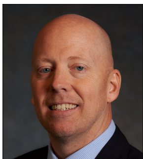
MICK CRONIN THE MICHAEL PRICE FAMILY UCLA MEN'S HEAD BASKETBALL COACH 3rd Season at UCLA