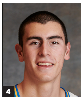
JAIME JAQUEZ JR.