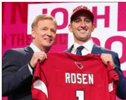
Josh Rosen (right) and NFL commissioner Roger Goodell

Men's basketball standout and first-team All-Pac-12 selection Aaron Holiday highlighted the Bruins' program at the 2018 NBA Draft in Brooklyn, N.Y., the night of Thursday, June 21. Holiday, a 6-foot-1 guard from Chatsworth, Calif., was taken No. 23 by the Indiana Pacers, joining