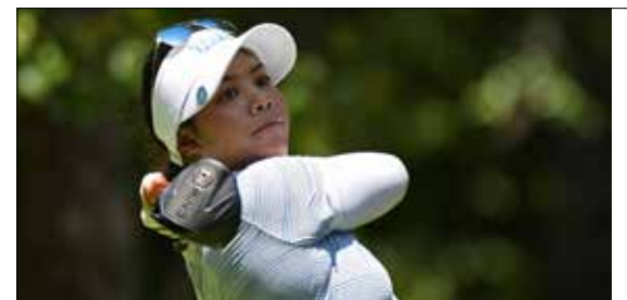
Patty Tavatanakit, women's golf