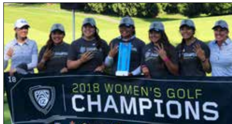
The women’s golf team after winning the 2018 Pac-12 title.