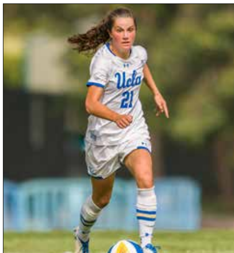
Jessie Fleming, women's soccer