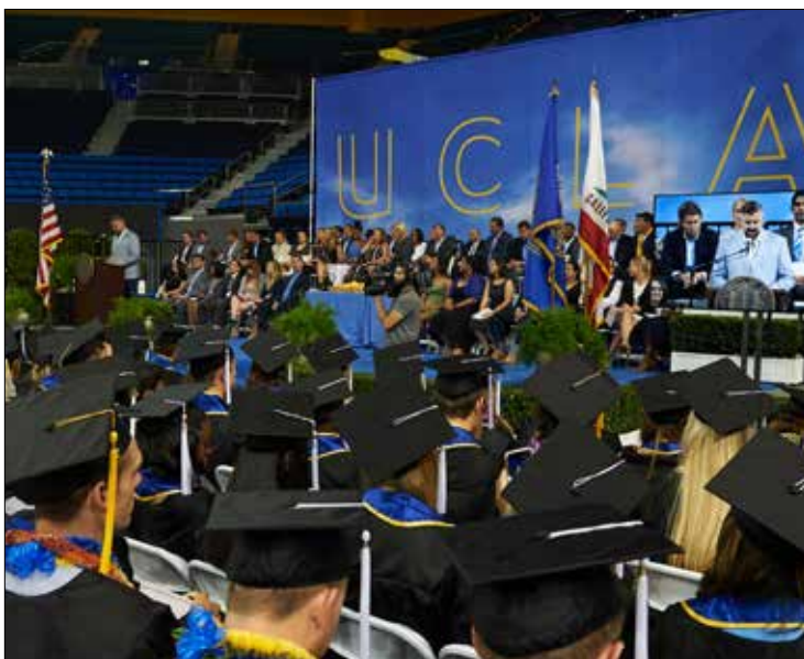
UCLA Athletics had 143 graduates at the 2018 student-athlete graduation ceremony.