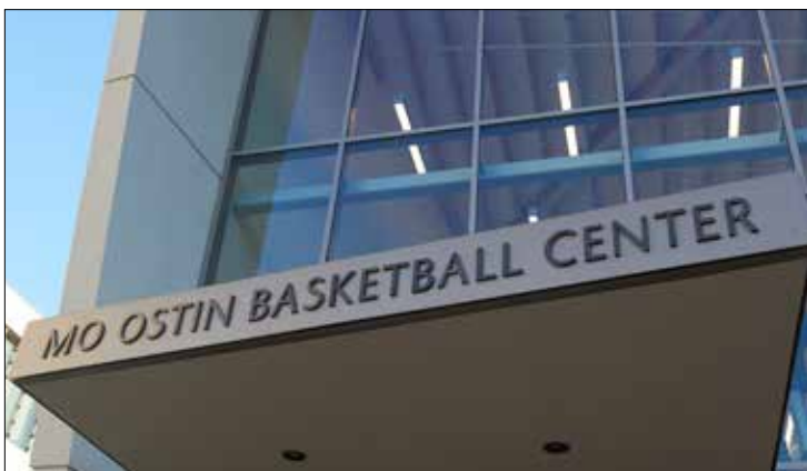
The Mo Ostin Basketball Center, which opened in October 2017.

Record giving from nearly 16,000 individuals over the past few years has already translated into impactful, tangible results in these three areas: