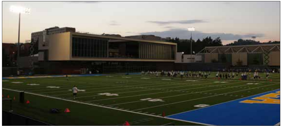
The Wasserman Football Center, which opened in August 2017.