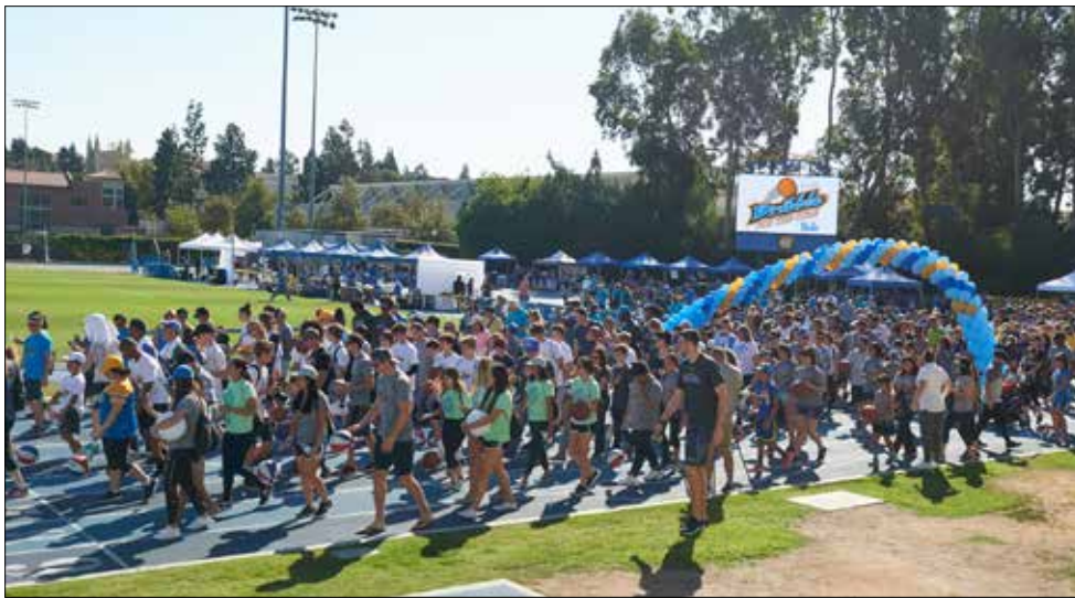
The starting line at the 2017 Dribble for the Cure (hosted at UCLA's Drake Stadium).