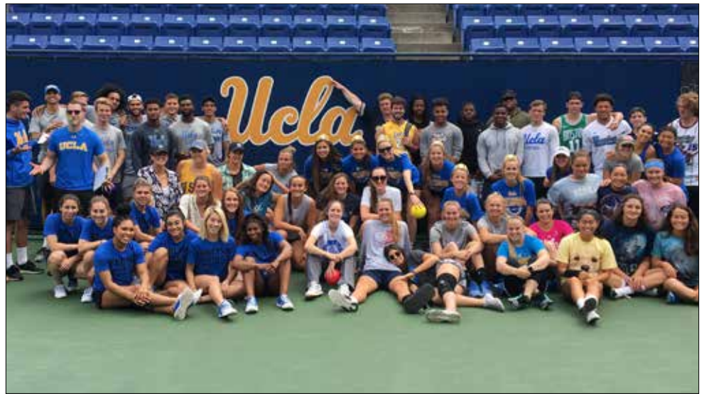
Student-athletes participating in the first annual student-athlete dodgeball tournament to raise resources for the Food Closet.