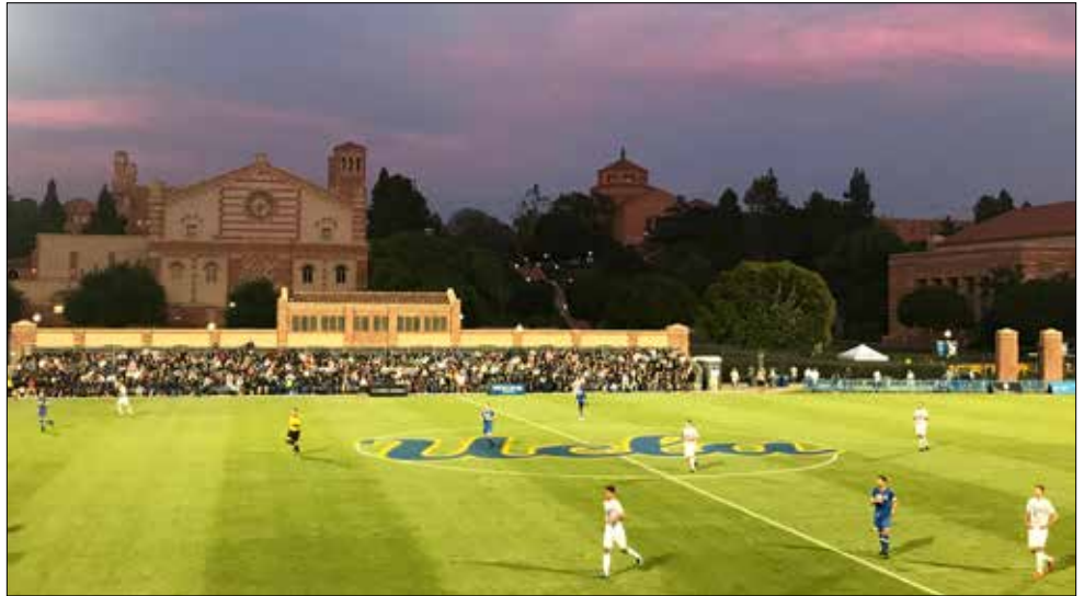
The view looking toward the East at UCLA's Wallis Annenberg Stadium.

The opening of the new facility in the fall of 2018 signals the first phase of Wallis Annenberg Stadium. Key features of the project's initial phase include grandstand seating and a press box on the west side, a Daktronics LED video board and Musco Sports lighting. Future phases of the stadium project may include expanded stadium seating, a training room, student-athlete locker room, coaches' locker rooms, meeting spaces, ticketing spaces and a new press box.