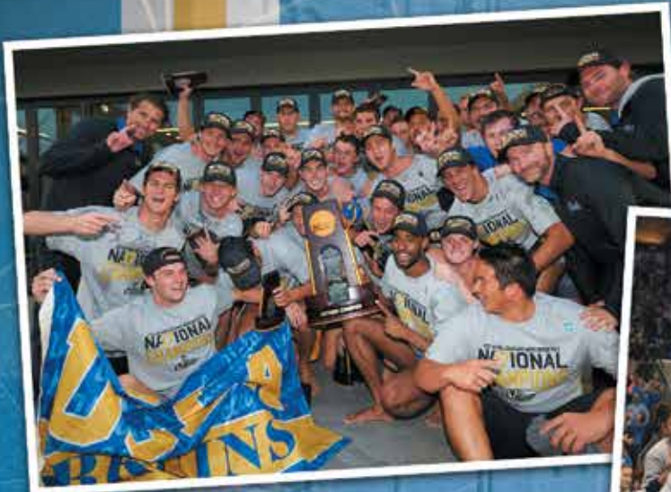
MEN'S WATER POLO 2017 NCAA CHAMPIONS