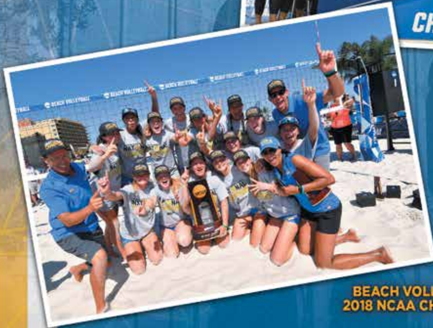
BEACH VOLLEYBALL 2018 NCAA CHAMPIONS