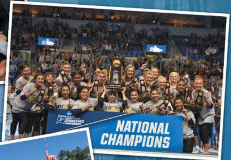
GYMNASTICS 2018 NCAA CHAMPIONS