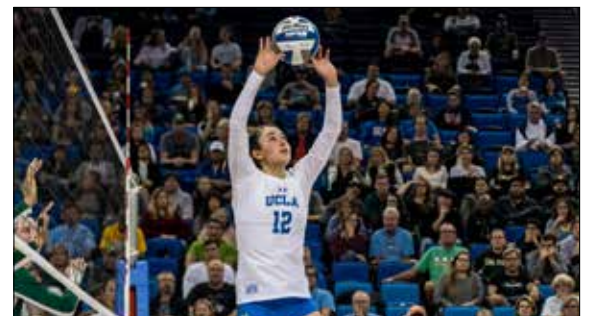
Sarah Sponcil, women's volleyball