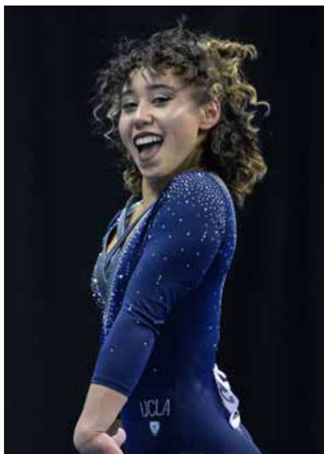
Katelyn Ohashi, gymnastics