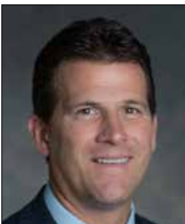
Steve Alford Head Coach 4th Year at UCLA 26th Year Overall