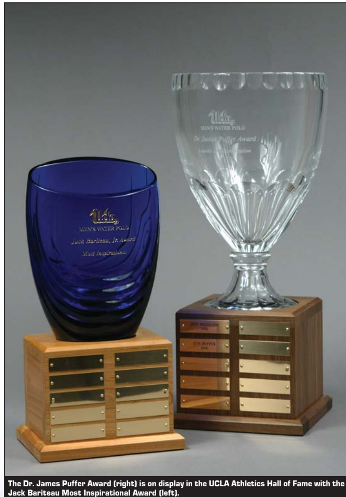
The Dr. James Puffer Award (right) is on display in the UCLA Athletics Hall of Fame with the Jack Bariteau Most Inspirational Award (left).