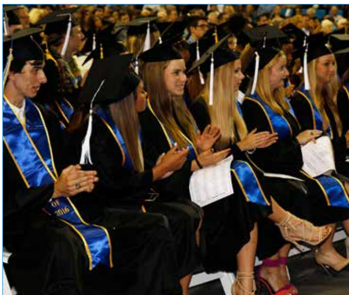
UCLA student-athletes during the graduation ceremony in Pauley Pavilion on June 9, 2016.