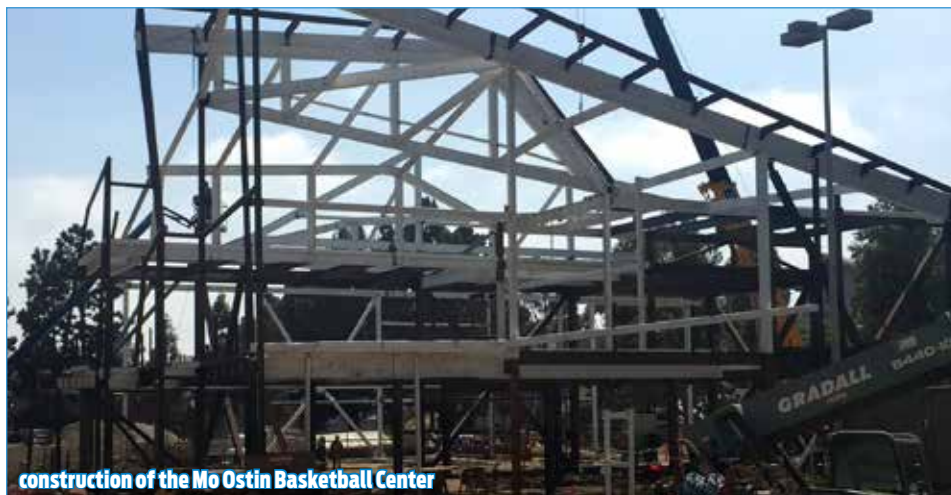
construction of the Mo Ostin Basketball Center