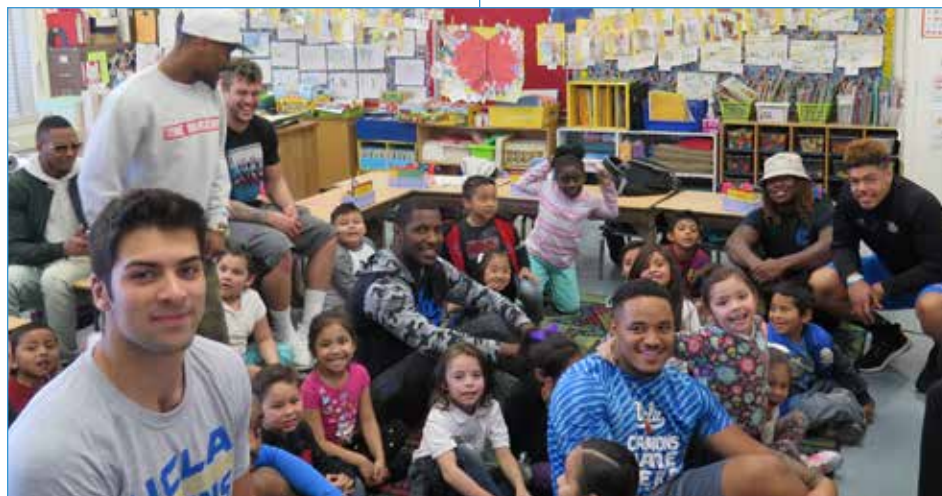
UCLA football players during a visit to the 186th Street Elementary School.

For the ninth year, members of the UCLA football team visited 186th Elementary School to participate in their annual Super Bowl School Spirit Day to celebrate the students' commitment to academic excellence. The student-athletes visited classrooms and participated in an after-school assembly that promoted the importance of citizenship, scholarship and sportsmanship. They encouraged the students to strive for excellence, respect their teachers, do their homework and work hard to achieve their goals and dreams.