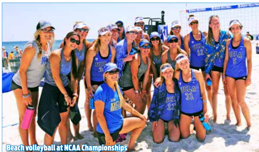
Beach volleyball at NCAA Championships