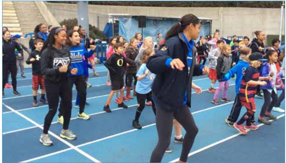
Student-athletes with youngsters at Lab School Fit Day, part of a healthy choices educational program taught at the Lab School on UCLA's campus in Westwood. The day consists of games, activities and making healthy food choices.

The Harper for Kids Youth Development Program is based upon former UCLA basketball coach John Wooden's "Pyramid of Success," striving to teach youngsters how to achieve their personal best in life. UCLA's student-athletes are able to interact with youngsters and talk to them about how their athletic opportunities are vehicles to heighten personal development and how the benefits of athletic participation can greatly help one's personal growth.