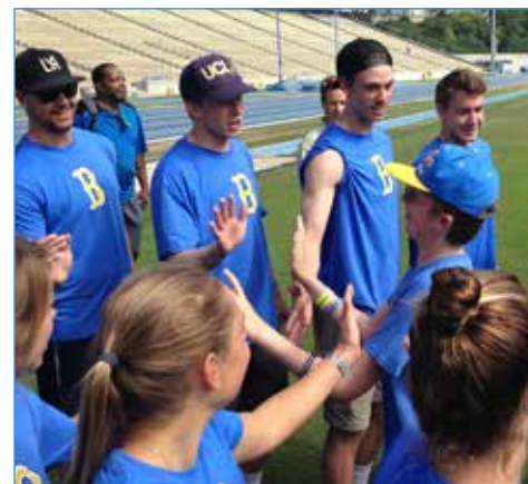
UCLA students welcoming participants at the Prime Time Games.