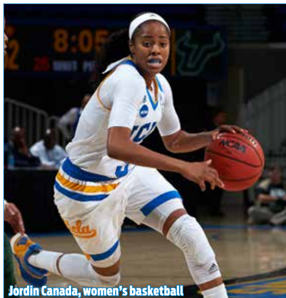
Jordin Canada, women's basketball