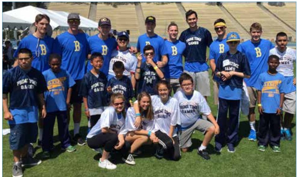
UCLA student-athletes assisting at the Prime Times Games, a fully inclusive peer-mentor sports program.