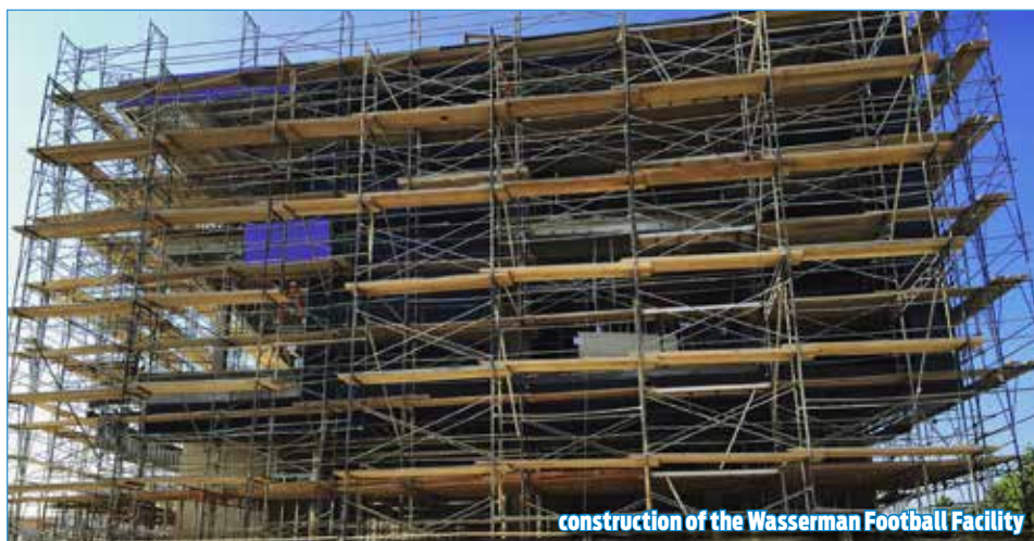
construction of the Wasserman Football Facility

Both projects and their campaigns to raise private funds are part of the $4.2 billion campus-wide UCLA Centennial Campaign. The UCLA Athletic Department aims to surpass its $260 million goal by 2019, securing more than $160 million since the campaign was announced in May of 2014. The Wasserman Football Center and Mo Ostin Basketball Center directly address the Department's primary Centennial Campaign objective: to create a financially sustainable future to build upon UCLA's standing as the premier intercollegiate athletics program in the nation.