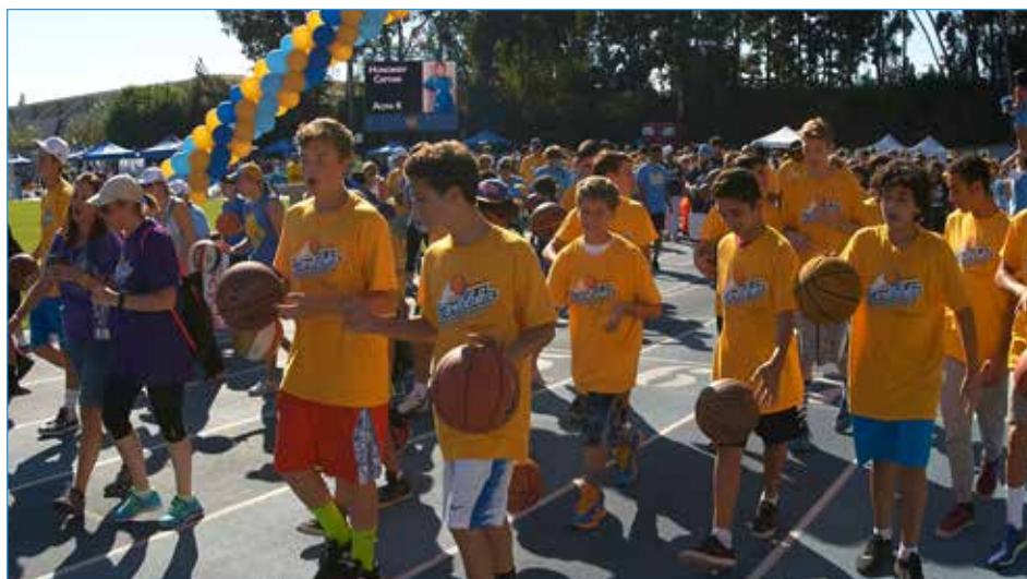
UCLA's Dribble for the Cure event reached an eight-year $1 million total donation mark in October 2015.