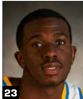
Prince Ali SO, G - 6-3, 190 PPG: -- RPG: -- GP/GS: --/--