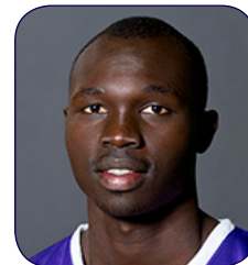
4 Chier Maker G/F • 6-7 • 200 • FR Sydney, Australia