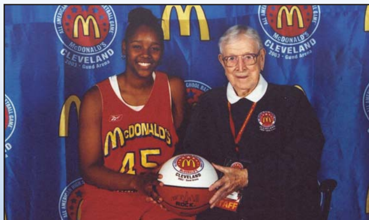
Coach Wooden with Noelle Quinn at the 2003 McDonald's All-American Game