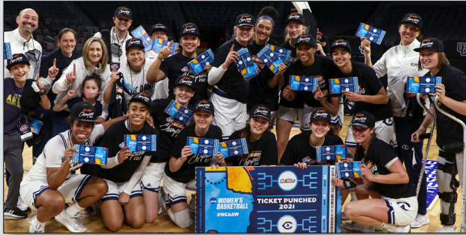
UC Davis has advanced to the NCAA Division I Tournament three times thanks to Big West Tournament wins in 2011 (top left), 2019 (top right), and 2021 (bottom).