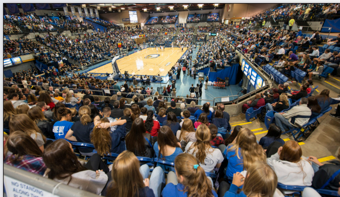
On Nov. 14, 2014, a record 4,712 fans filed into the Pavilion to watch the UC Davis women's basketball take on No. 1-ranked UConn for a televised season opener.

The women's record of 4,712 was set on Nov. 14, 2014, when the Aggies welcomed top-ranked and defending national champion UConn to Northern California, while a clash against Bay Area rival Stanford drew 3,366 fans in 2015.