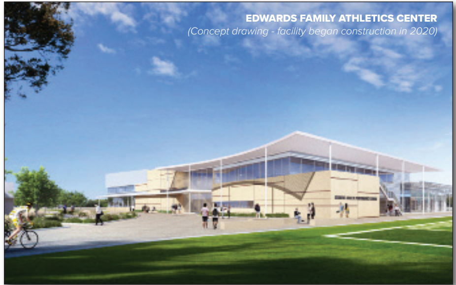
EDWARDS FAMILY ATHLETICS CENTER (Concept drawing - facility began construction in 2020)