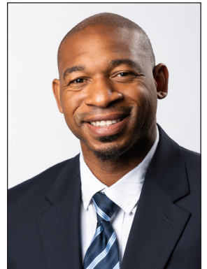
Holeman Copeland Cornerbacks