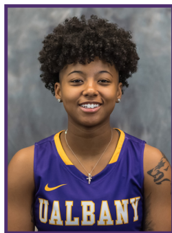
2 KYARA FRAMES So. / G / 5-2 Laurel, Md.