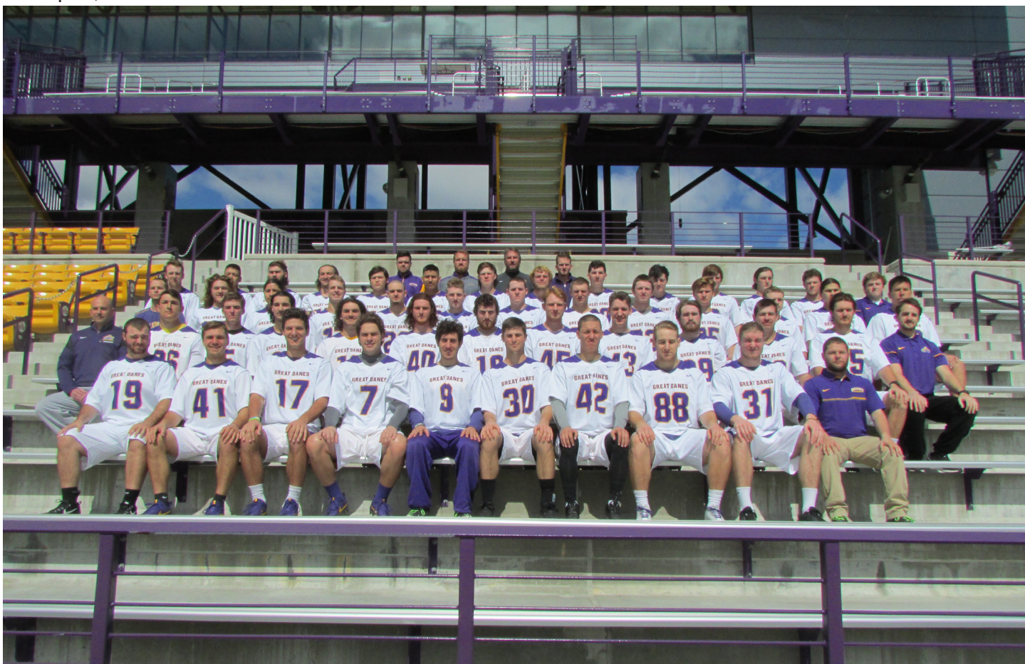
University at Albany 2017 Team Photo

In its 2018 14-game regular season, UAlbany is set to take on three reigning regular season champions, including three ranked in the top-10 in the preseason polls. UAlbany is set to take on league regular season champions Syracuse, Maryland and Yale, all three on the road.