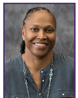
YOLANDA GRIFFITH Assistant Coach First year at UAlbany